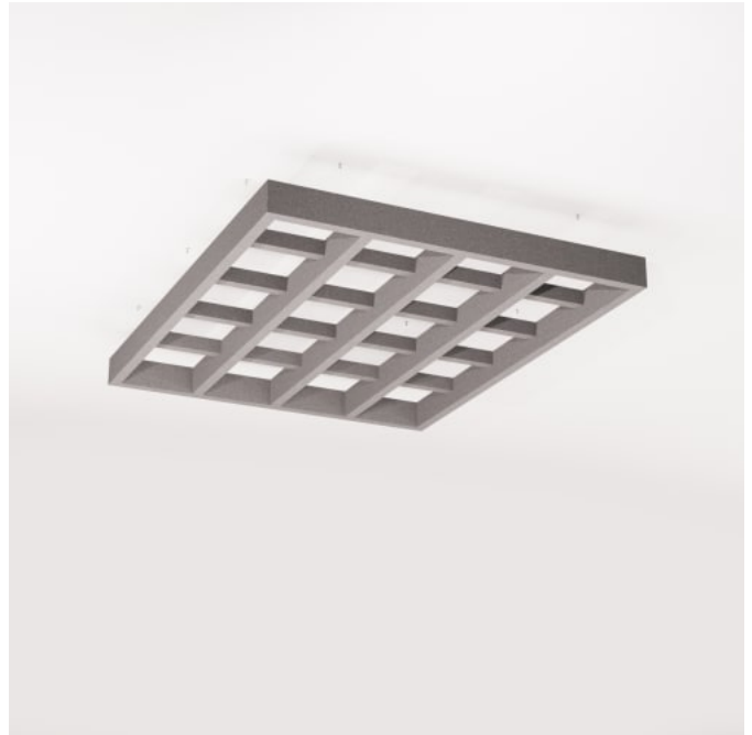
Beams Closed Rafter 4 x 5 Detail