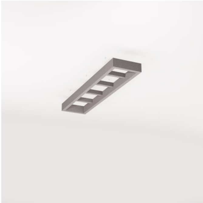
Beams Closed Rafter 1 x 5 Detail