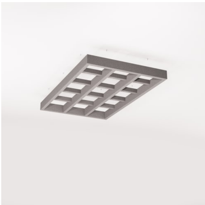
Beams Closed Rafter 3 x 5 Detail