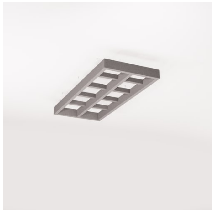
Beams Closed Rafter 2 x 5 Detail