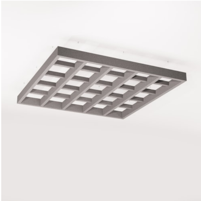
Beams Closed Rafter 5 x 5 Detail