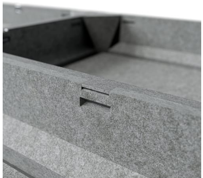
Box Tile Double Beams Clip Fixing