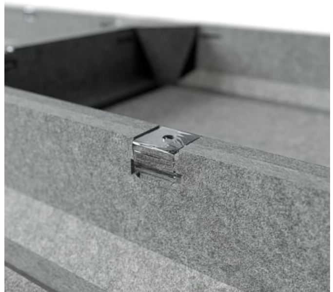
Box Tile Double Beams Clip Detail